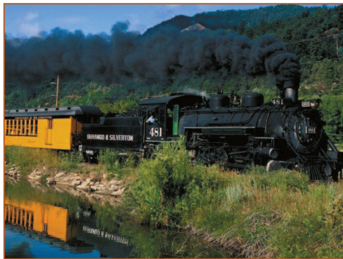
Members of the Grand Canyon Chapter will ride the Durango & Silverton Narrow Gauge Railroad through spectacular scenery in Oct. 2012.