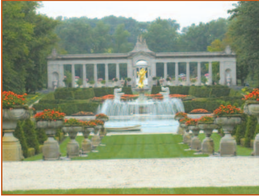
Central Atlantic members toured the spectacular Nemours Gardens of Albert duPont.