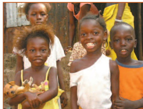
Youngsters in Y programs in Sierra Leone.

The YMCA reaches more than 10,000 youth and families annually. The organization is able to