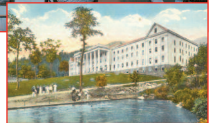
(Top) Blue Ridge rockers with the view. (Bottom) Old postcard showing Lee Hall.

Years later, in 1979, Blue Ridge Assembly's beautiful grounds and cherished structures were accepted into the National Register of Historic Places. The Assembly, in more recent decades, has served as