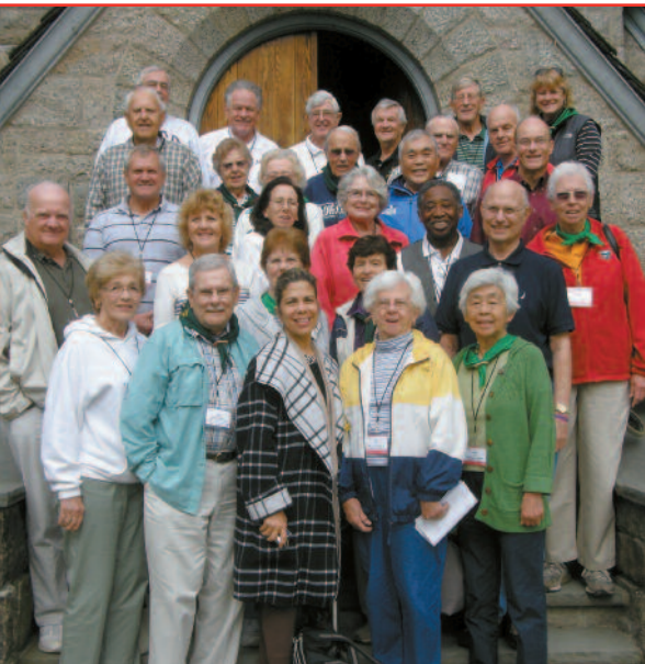
Attendees at Silver Bay in front of the Chapel at a multi-Chapter event.

... On The Edge was the theme of a multi-chapter event at the Silver Bay, YMCA of the Adirondacks on